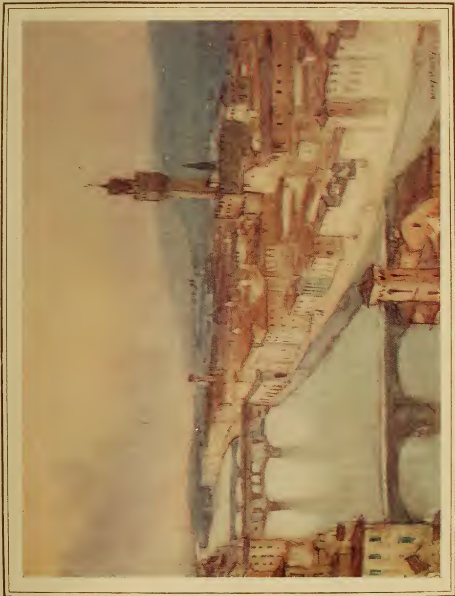
VIEW OF FLORENCE AT EVENING FROM THE PIAZZALE MICHELANGELO